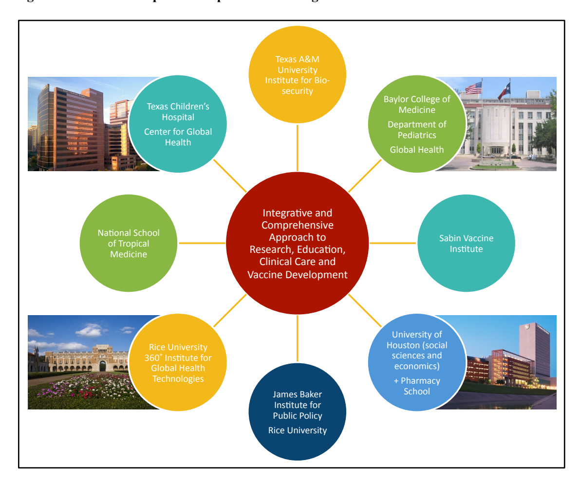
Figure 2: Institutional partnerships for advancing awareness and interventions for NTDs

University 360° for Global Health Technologies, along with additional partnerships with other universities in economics and the social and pharmaceutical sciences.