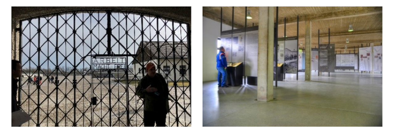
L and R: Our tour guide at the entrance gate to Dachau; A visitor ponders the exhibits at Dachau.

These thoughts and questions speak to the urgent need for an ethics of remembering grounded in notions of mutual respect and dialogue. At its best, memory work can proceed in tandem with community building, with members each bringing their unique perspectives to bare in the search for common identities and deeper truths.